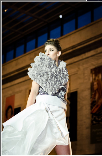
IMAGES OF PRODUCT RUNWAY PRODUCTIONS ACROSS THE COUNTRY

We cannot wait to see the South Central Chapter shine!! Friday the 13th never looked so good!!